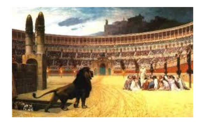
Depiction of Christians in the Colosseum

Persecution of Christians has continued in every century. For the purposes of this course, we will focus on persecution as Christianity and the New Testament were being rolled out.